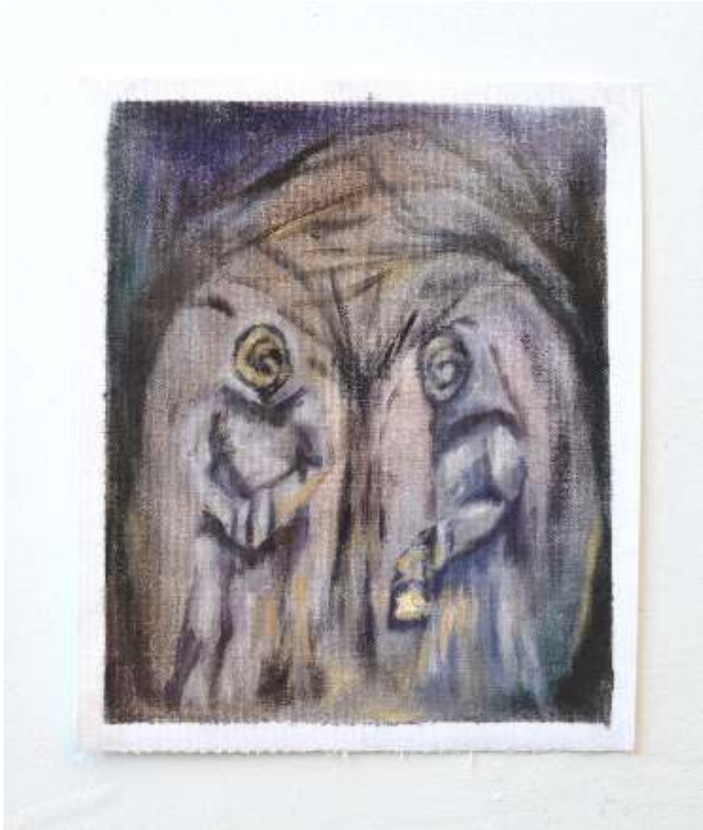
Beekeeper's Labour II – oil on canvas paper, 21x29.7cm