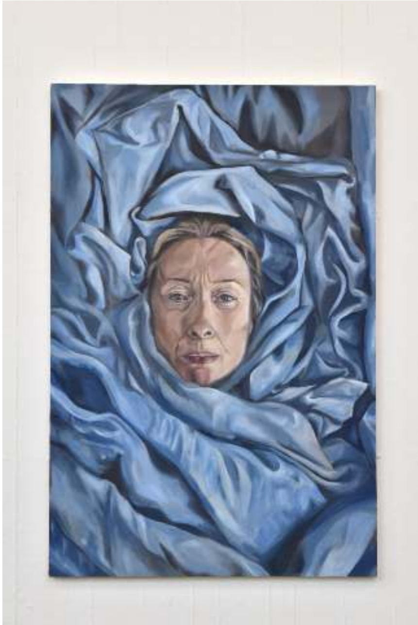
Wimple Gossip I , oil on canvas, 150x100cm