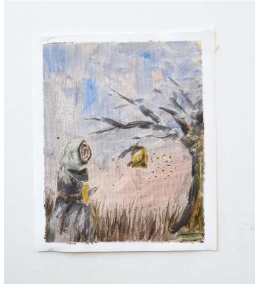
Beekeeper's Labour I – oil on canvas paper, 21x29.7cm