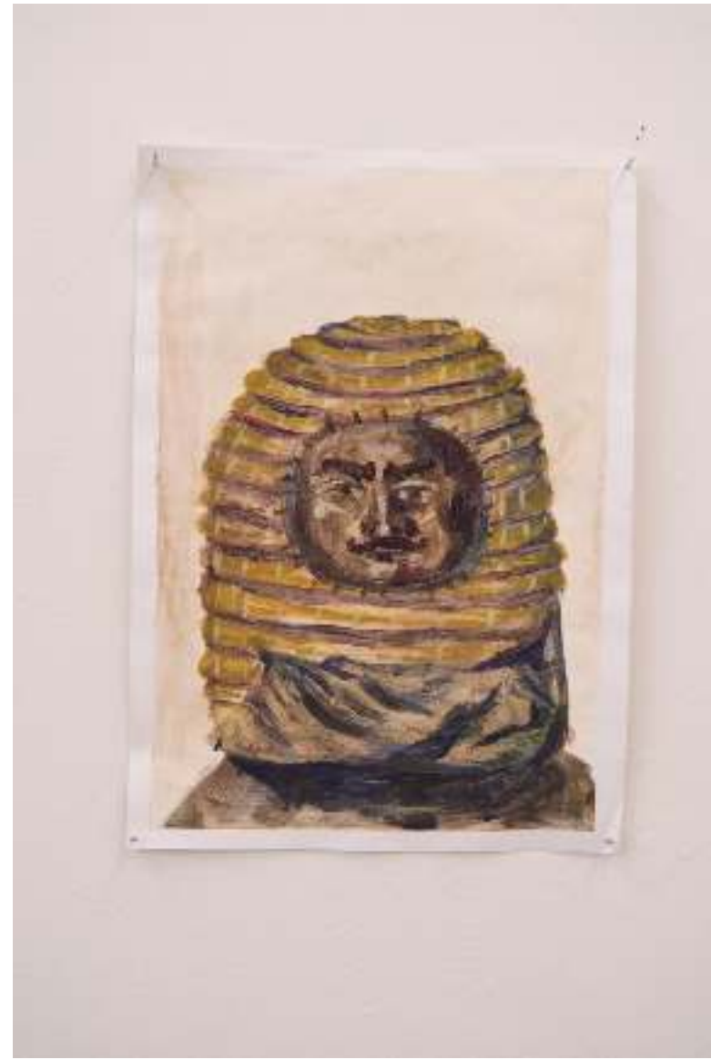
Displayed for Project Space I.05 – (left to right) 'The Farmer Charmer' , oil on paper 42x60cm; 'Untitled' oil on board 21x29cm; 'Are you Charmed?' Oil on paper 29x41cm