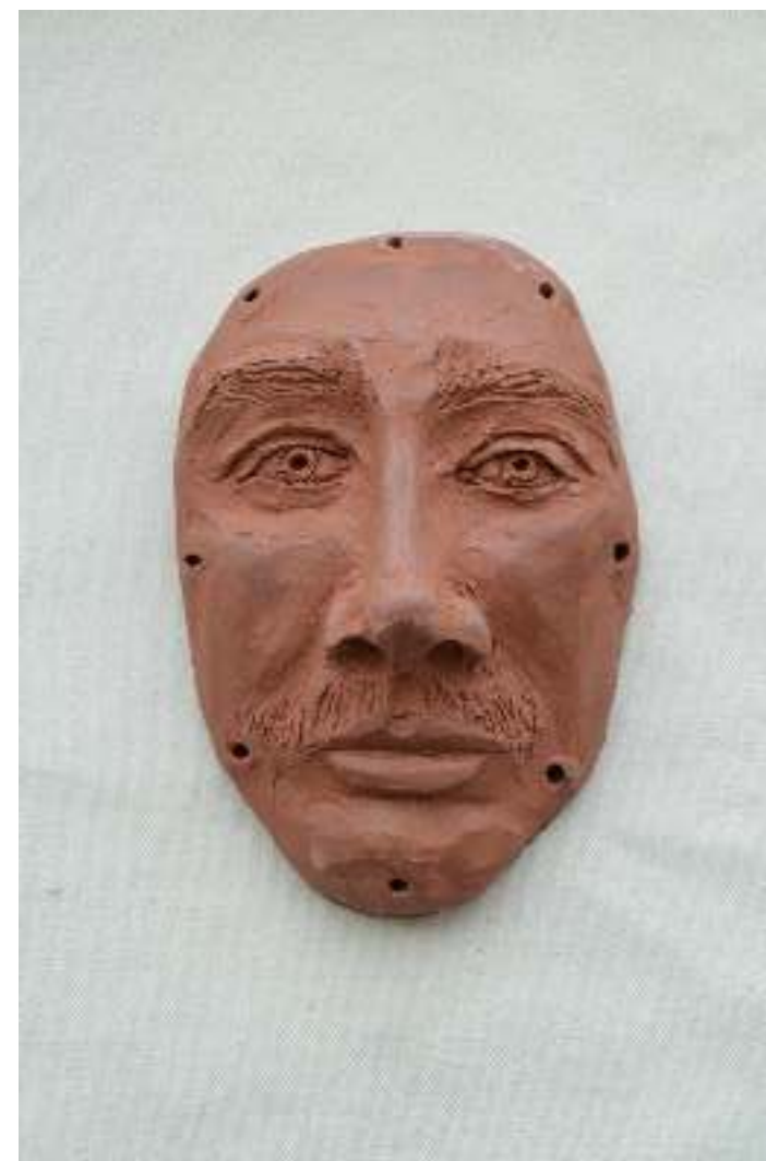
Cameron Face, ceramic, 12x14cm