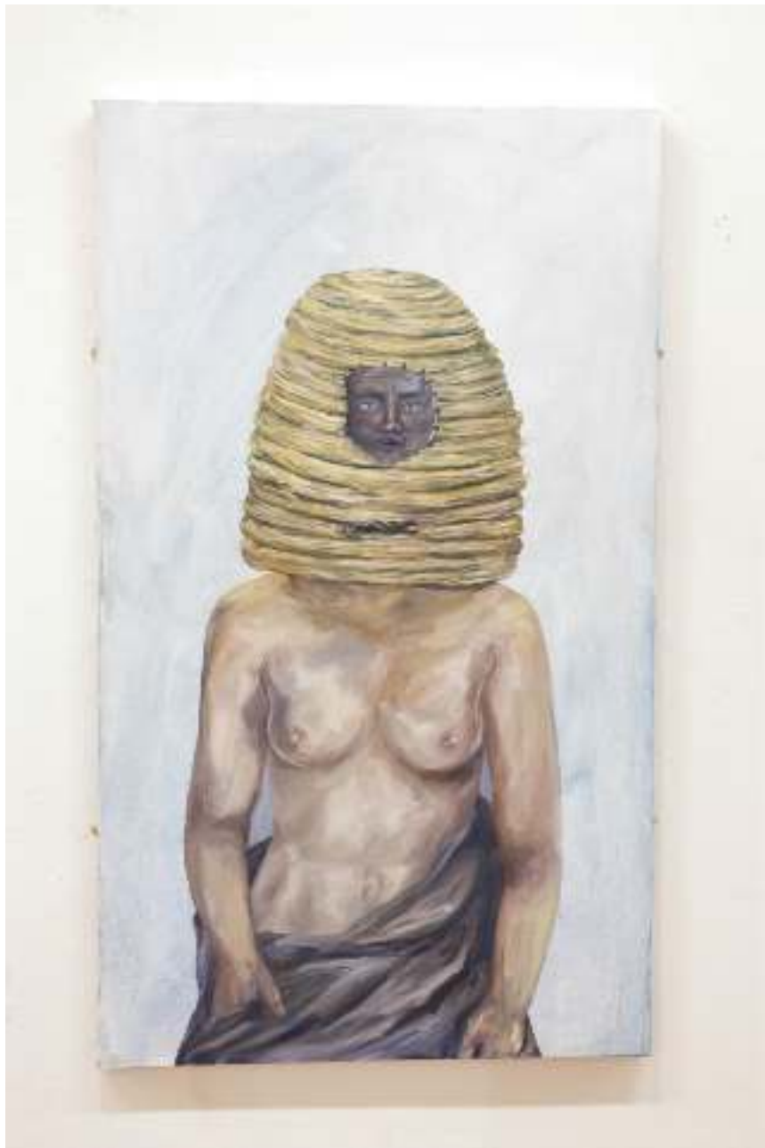
Body is Honey – Oil on canvas, 70 x120x 3cm