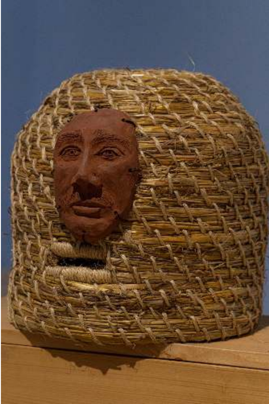
Cameron Skep , Ceramics, bee skep, wooden box, 35x35cm