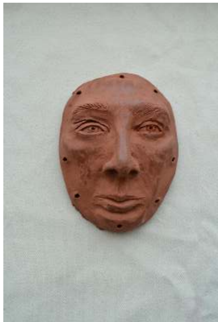
Charlotte Face, ceramic, 12x14cm