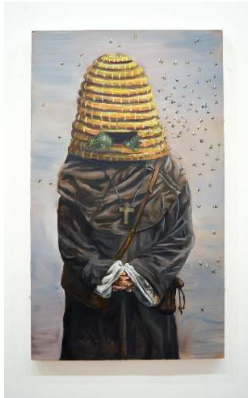
The Keeper – Oil on canvas, 70 x120x 3cm