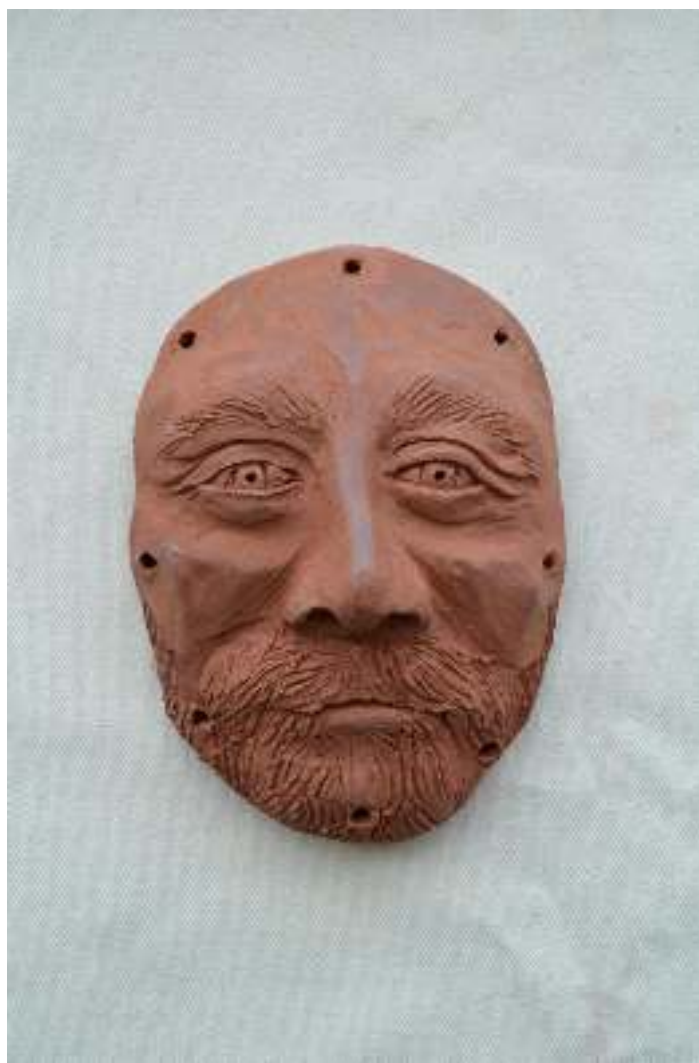
Bob Face, ceramic, 12x14cm