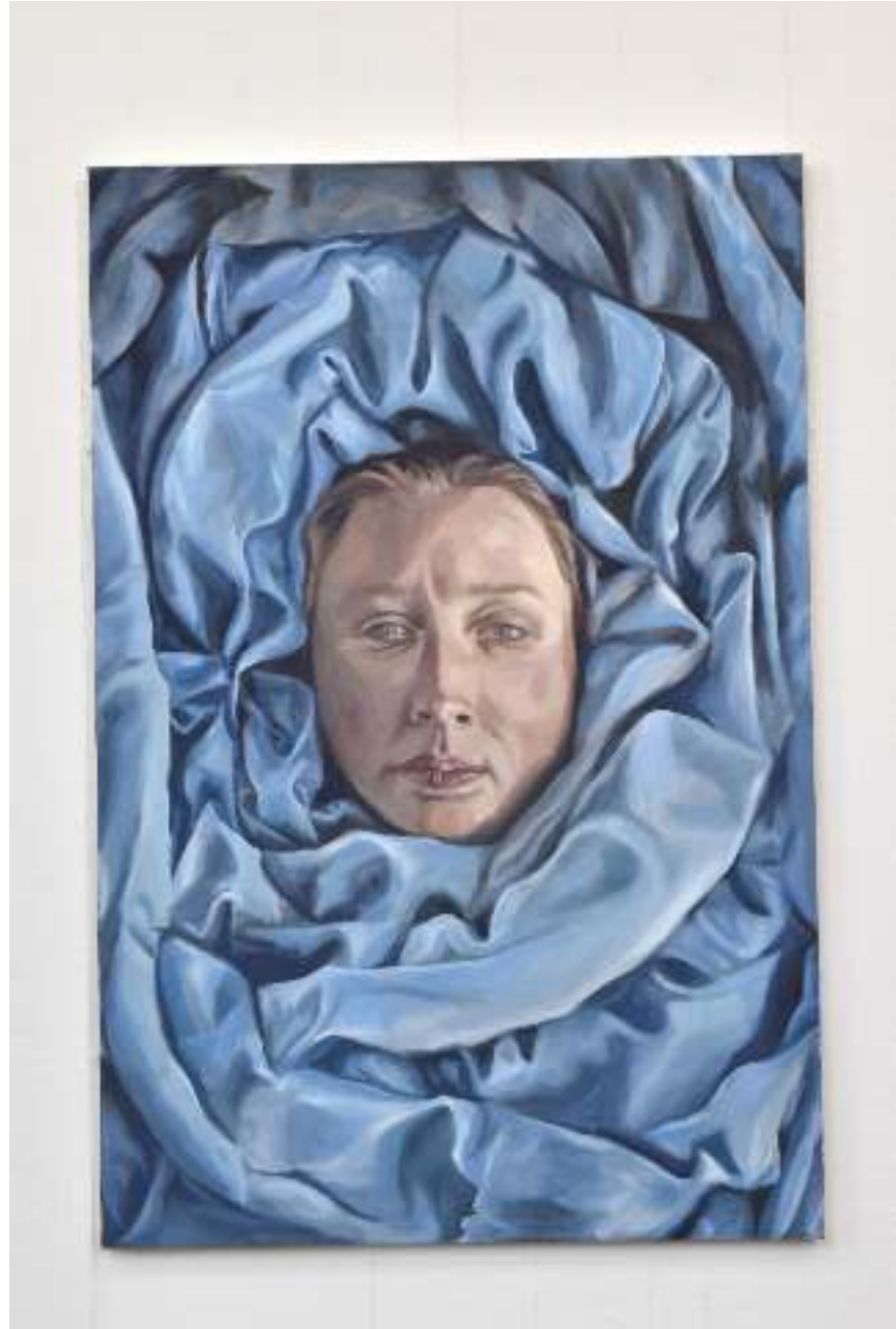
Wimple Gossip II , oil on canvas, 150x100cm