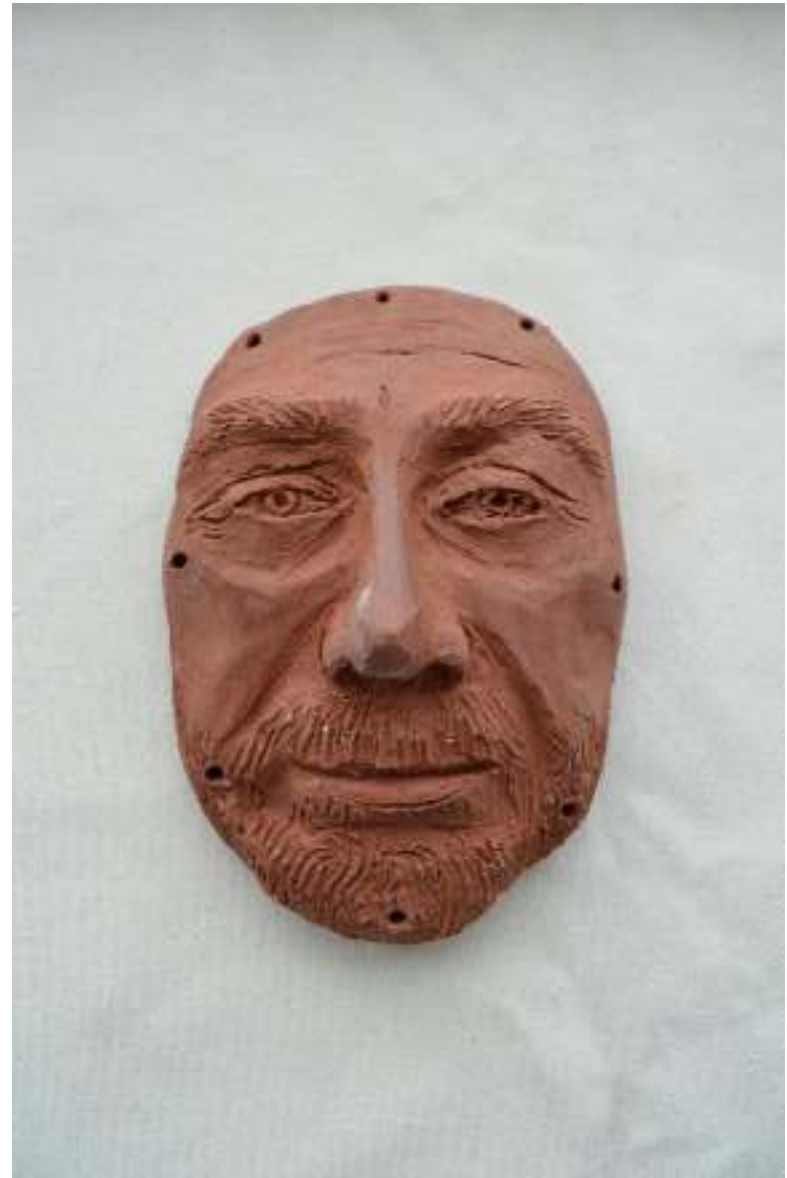
Eddy Face-The Keeper 12x14cm