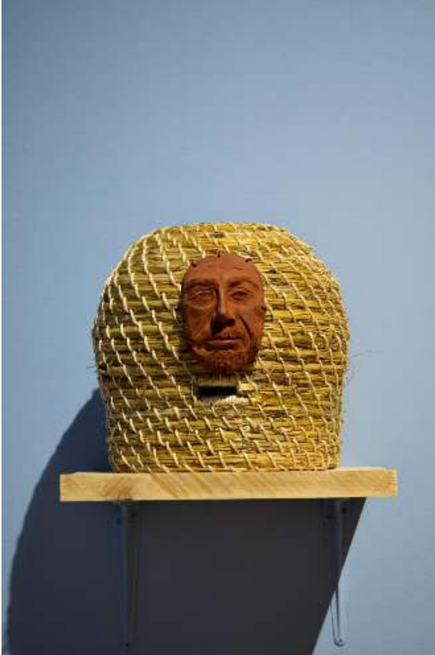
Eddy Skep ceramics, bee skep, shelf, 35x35cm