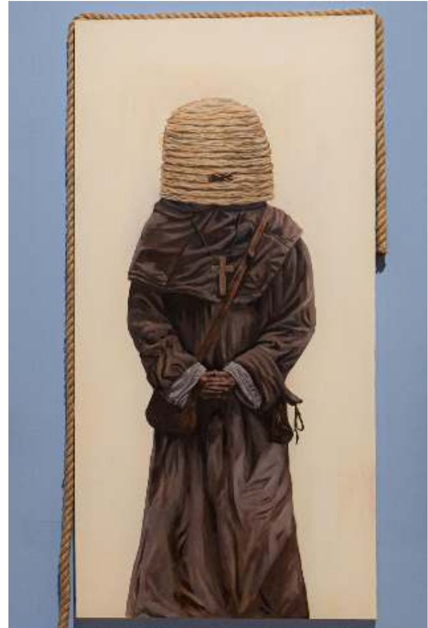
Father Keeper , Oil on Canvas, 205x105cm