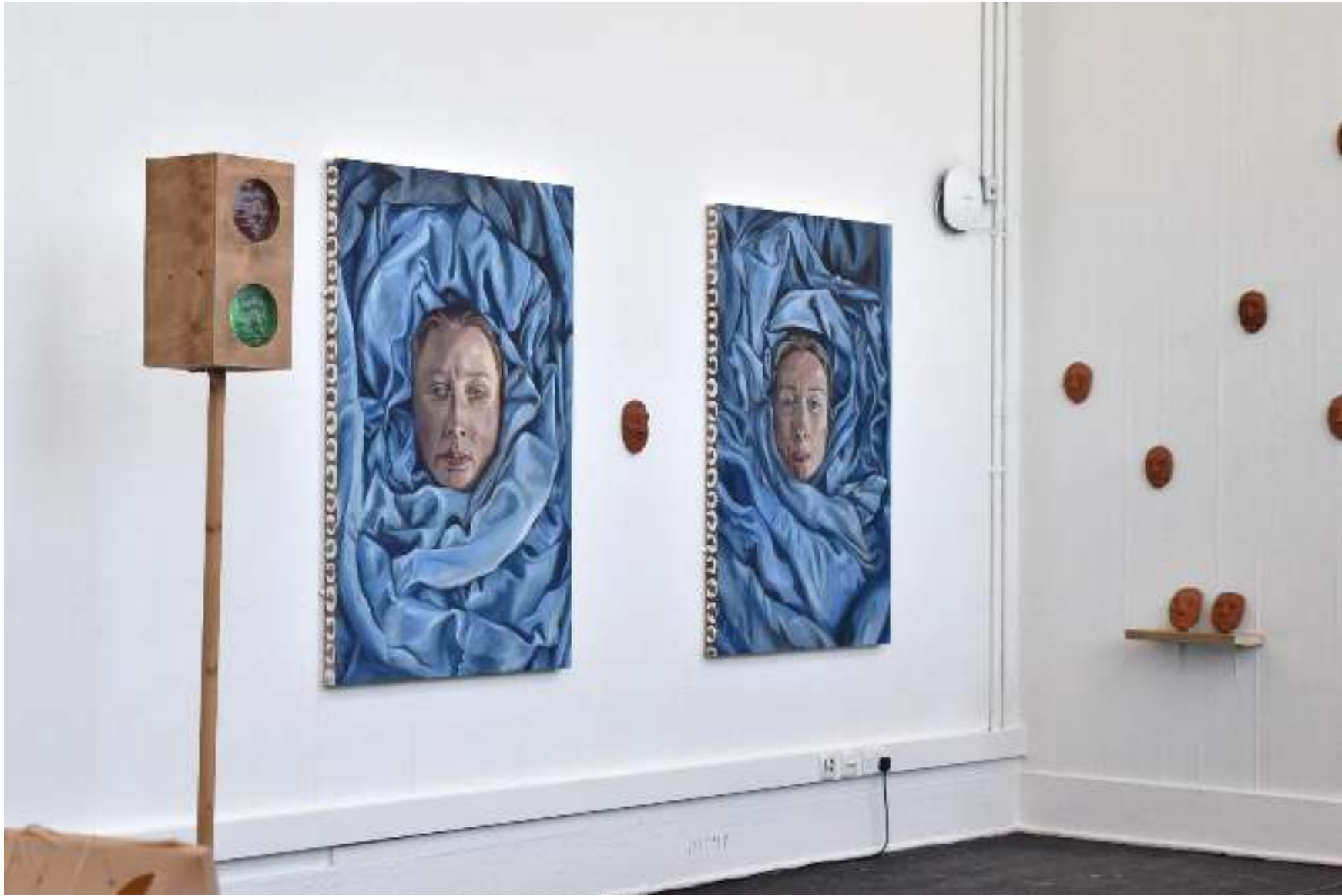
Does The Meadow Talk? , installation view, oil on canvas, ceramics, wood, glass, installed for degree show 30/05/2025-6/06/2025