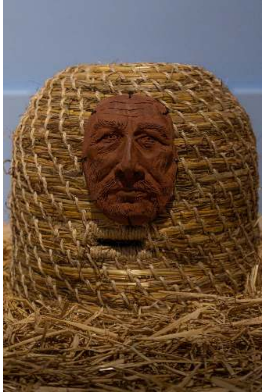
Stuart Skep , ceramics, bee skep, straw, 35x35cm