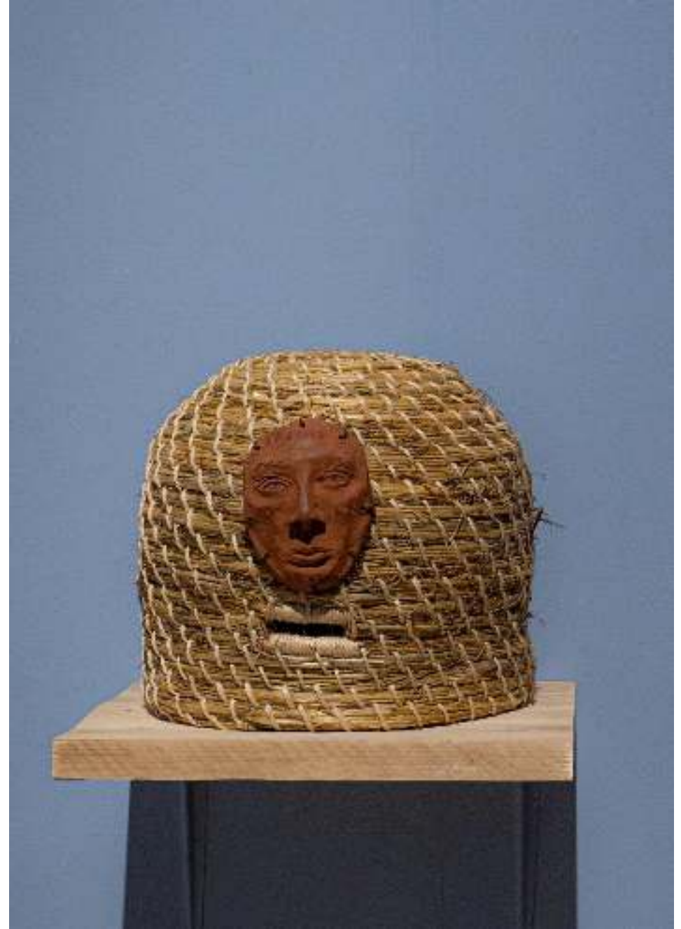
Sister Skep ceramics, bee skep, shelf, 35x35cm