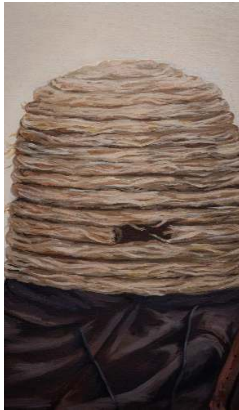
Details – Father Keeper , 210x105cm, oil on canvas.