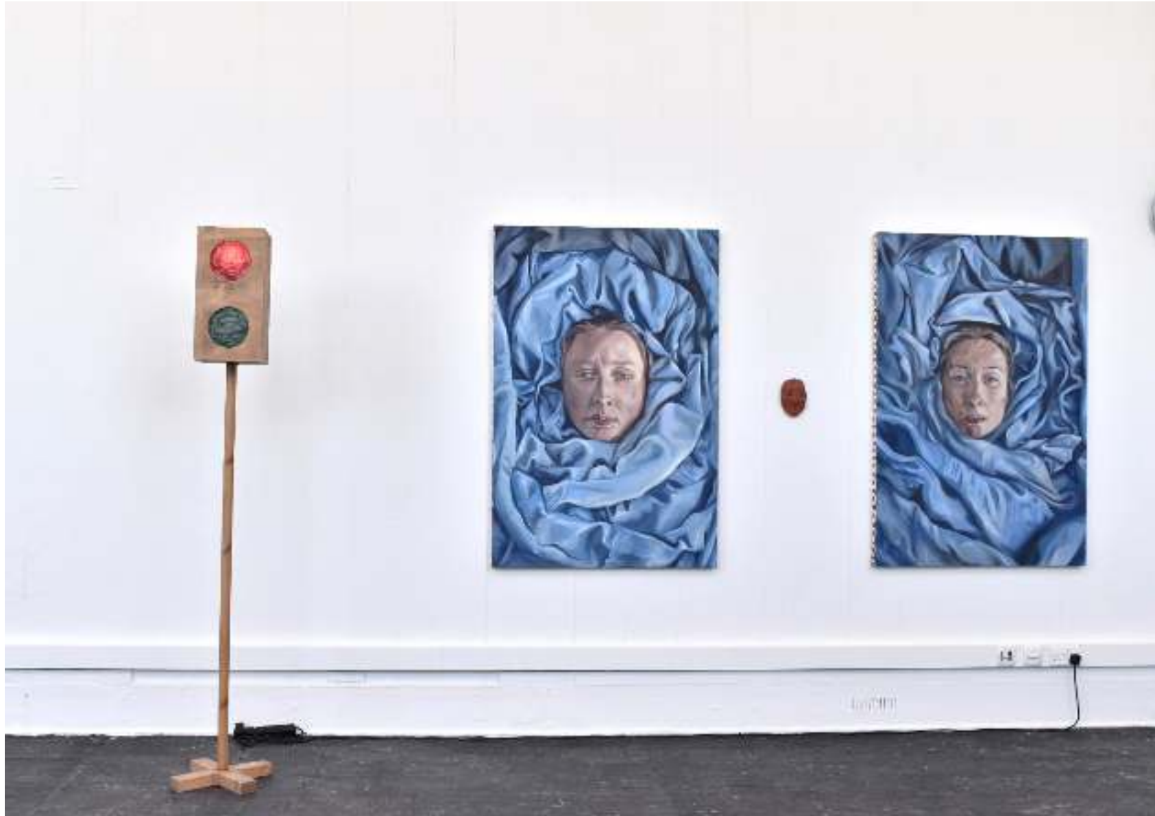
Does The Meadow Talk? , installation view, oil on canvas, ceramics, wood, glass, installed for degree show 30/05/2025-6/06/2025