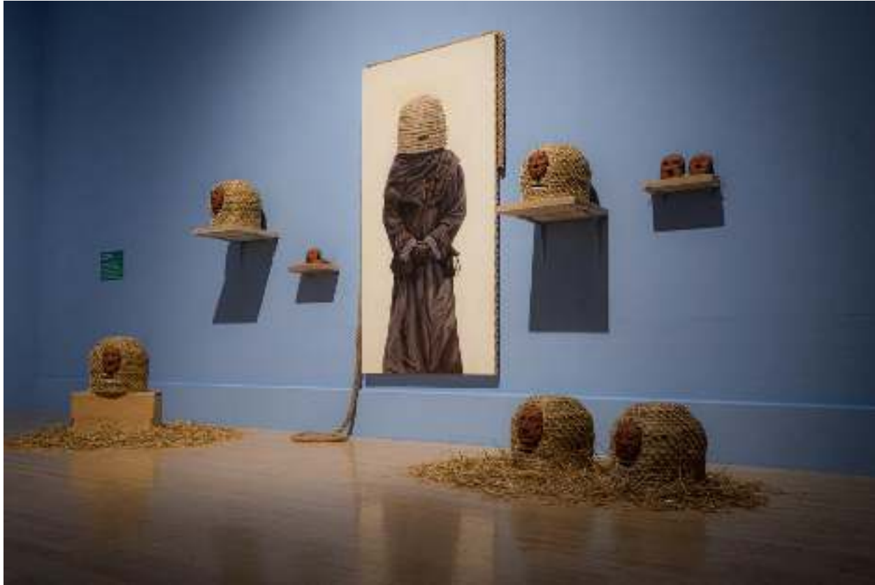
The Bees Were Here Installation shot, Oil on Canvas, ceramics, straw, bee skep, wooden shelves, rope. Displayed at Talbot Rice Gallery 15/03/2025-31/05/2025