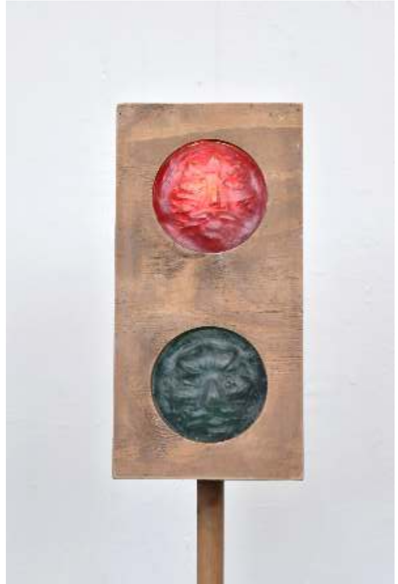
Green Man Traffic Light , glass, wood, electronics, 210x25cm